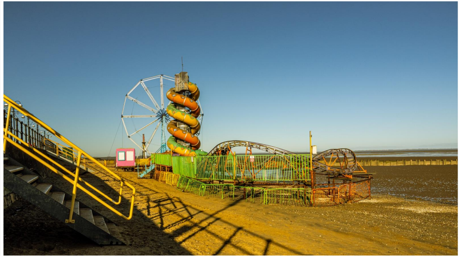
answers on a postcard please

There are many wonderful photography opportunities up and down the country, so let's see if you know where this is ...