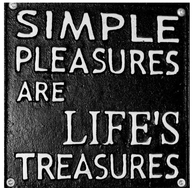
One of the panels from Bev's triptych contained a message for all..

We've got a model shoot coming up soon that will make use of off camera flash. Help will be on hand but have a good look at the settings on your camera for using external wireless triggers and flash. Bring your ideas - there is a link in "Lookup and Links" part of the newsletter to some excellent posing and lighting tutorials