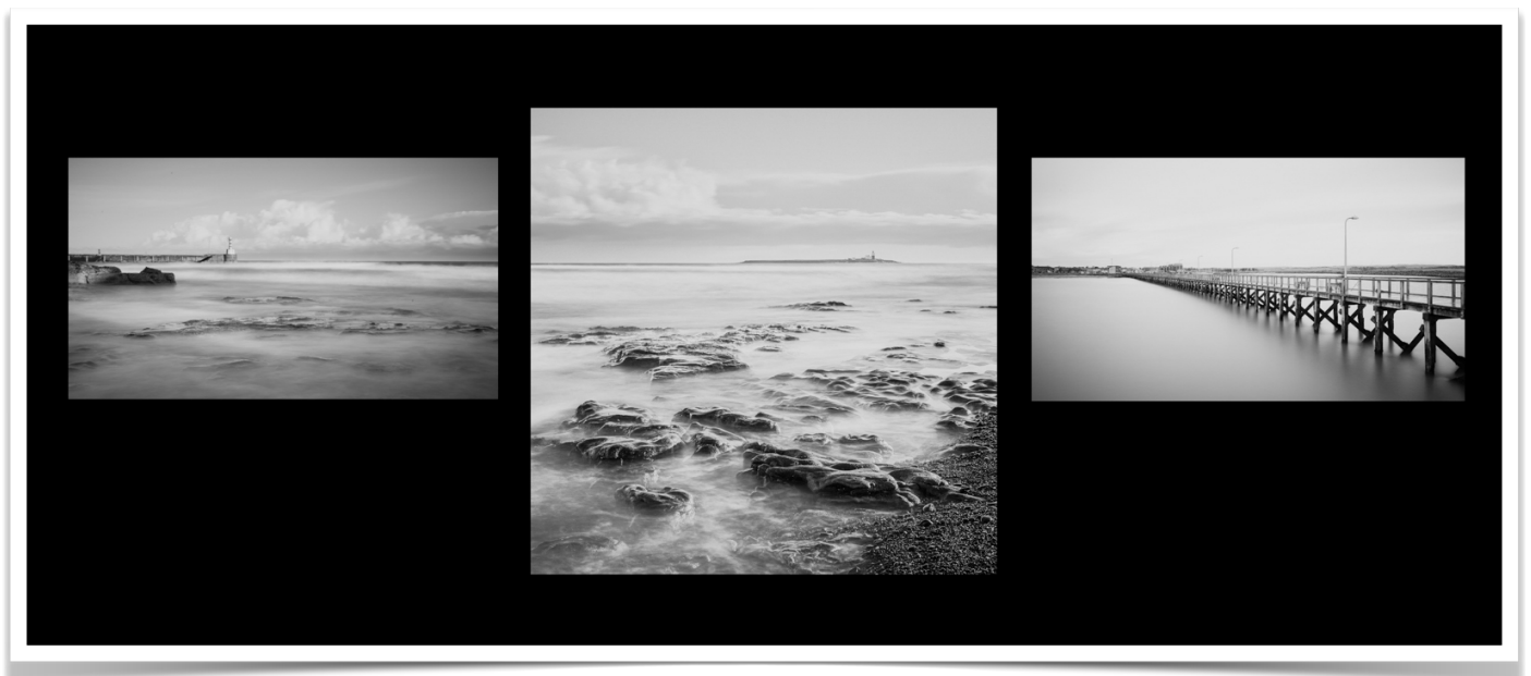
Rob on the North East coast

This weeks photography album is drawn from some of the images that members submitted to