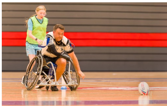
Wheelchair Rugby League. Disability and Ability