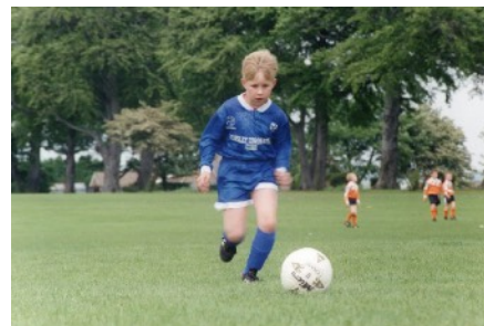
From the family archives, one of my early sport photos from about 30 years ago. Look how little the 'guys' in orange are!

Photography, for me, has always been about people – their energy, their character, their stories. While I occasionally point my lens at a landscape, my heart has always belonged to sport and portraiture. Its about people – their energy, their character, their stories. There's something uniquely satisfying about freezing a moment of intensity on the pitch or capturing the quiet honesty of a face in a portrait. Those are the moments that feel alive to me.