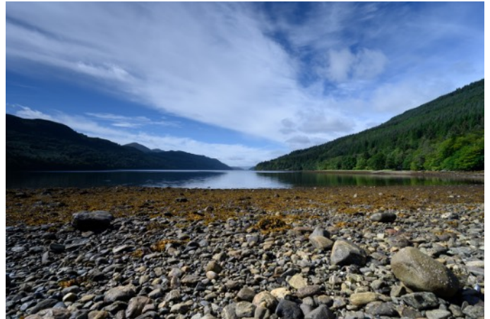
Using a polarising filter and graduated ND filter