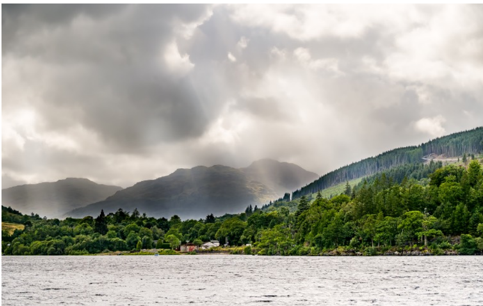
Embrace the weather (Liquid sunshine in Scotland)