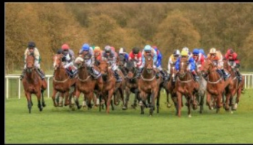
The Big Race