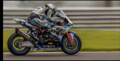
Movement called Speed