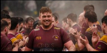
Smile at the End