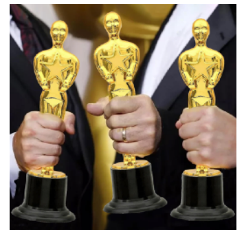
The YPWhat! Awards