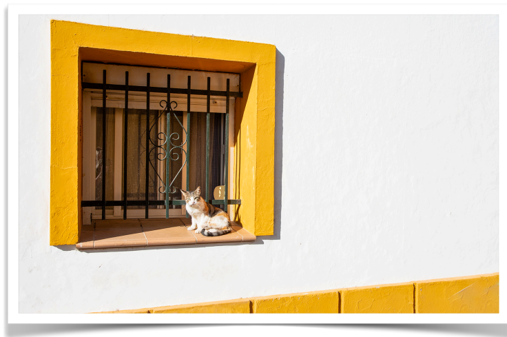
Cat on a Window sill by Cath