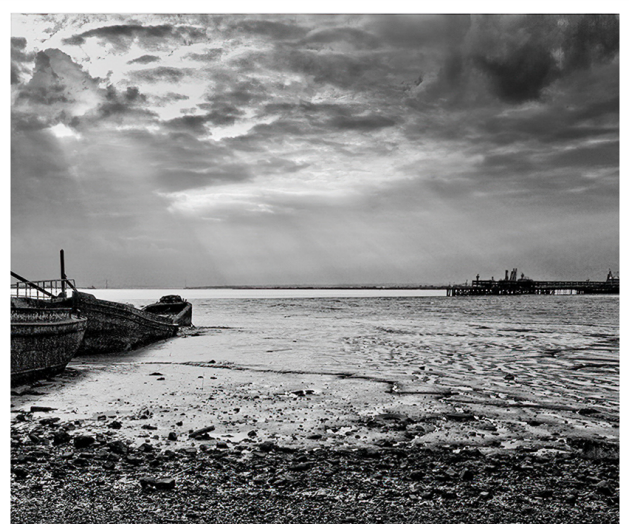
But Ali is wrecked on the humber.