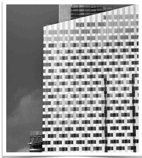
A more modern approach form Marsha.