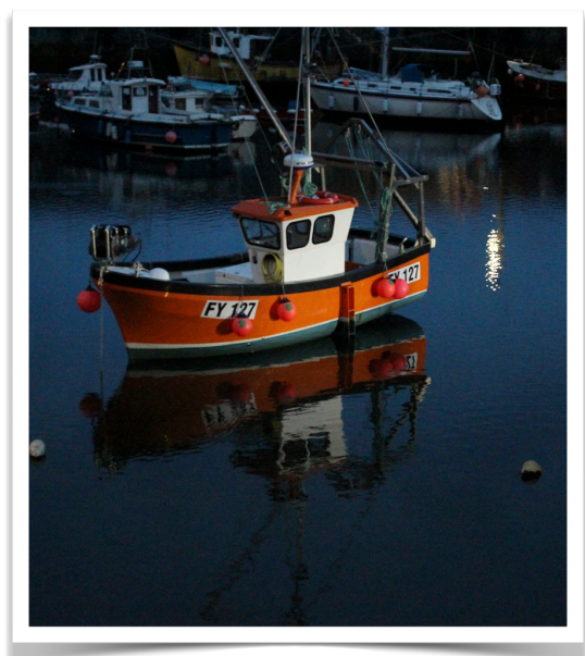
Brian is all afloat