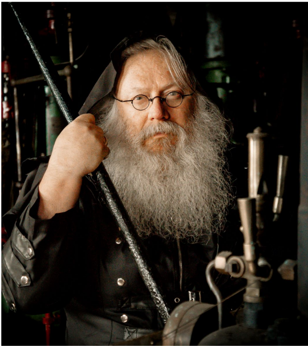
A days shooting at Wortley Top forge

This weeks photography album is drawn from some of the images that members sought critique and advice on how to teak and make them even better. Some images here have been re-